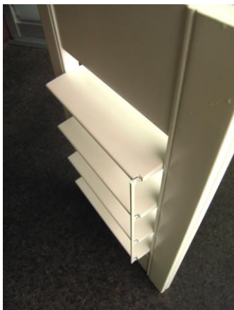
Basswood frame 25mm and 19mm thick

The warranties offered vary and from our experience we have found the local warranties of the reseller differ from that promoted by the Chinese manufacturer.